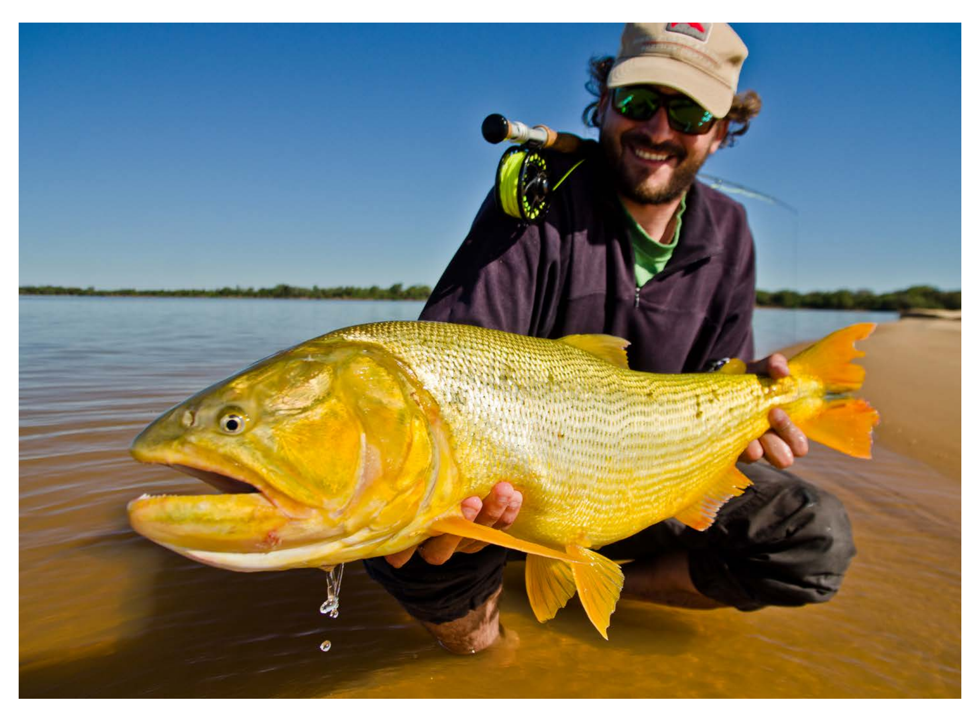
Double-digit Dorado are real possibilities... and that is PRO's main focus