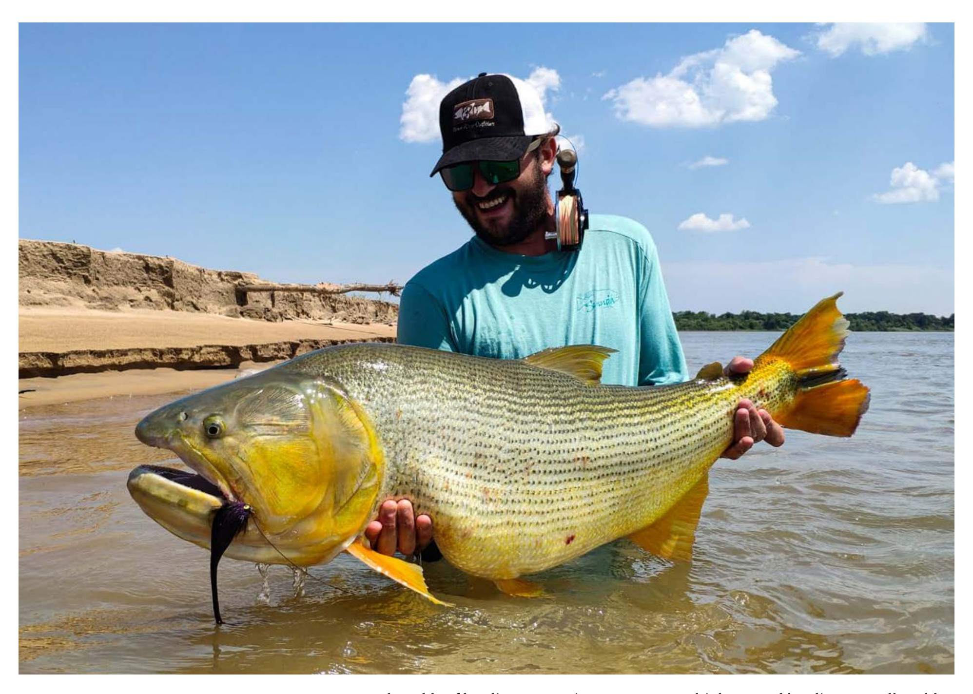
At PRO, the odds of landing a true river monster are highest, and landing a 40-lb Golden Dorado on a 7-weight rod is a true possibility