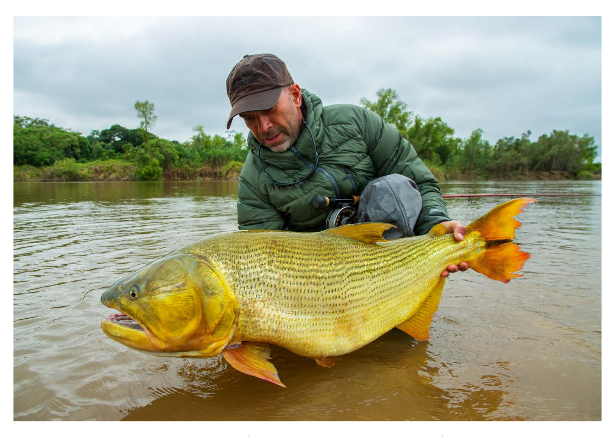
You'll sight-fish to monsters prowling the river's long sandbars. Aggressive Dorado gorge on the baitfish, growing to sizes of 10 to 40+ lbs.