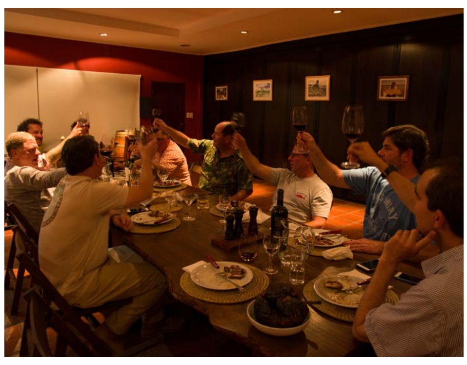
Dinner is served in our private dining/living area back at the lodge where you can expect delicious meals each night.