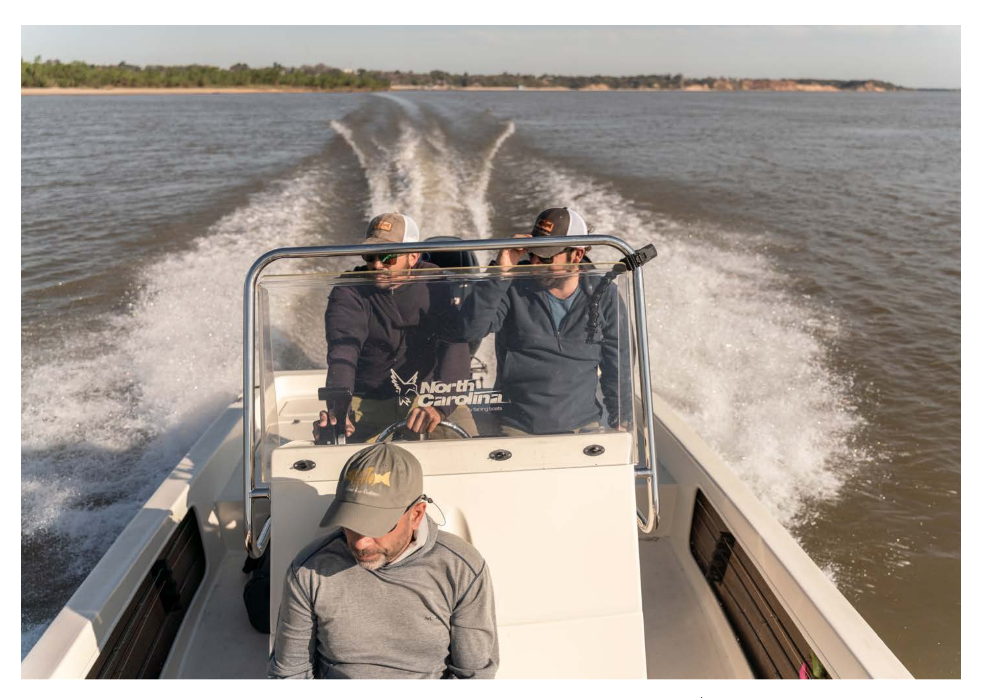
Morning rides out into the Paraná, and our favorite riachos are simply the best way to wake up on a crisp spring day in Corrientes.